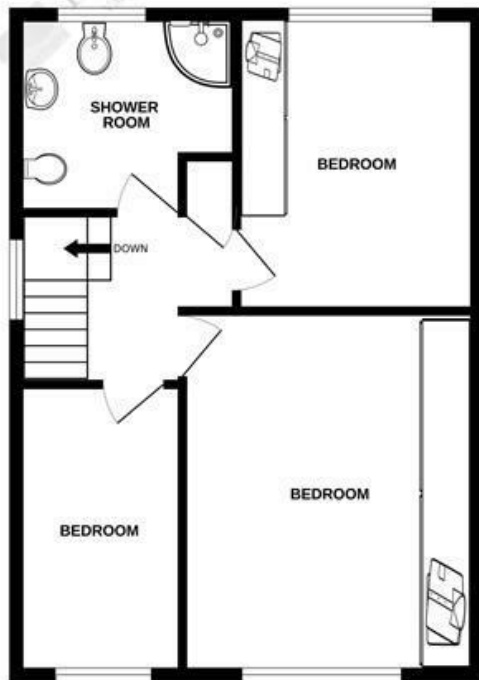
TOTAL FLOOR AREA : 1321 sq.ft. (122.7 sq.m.) approx.

Whilst every attempt has been made to ensure the accuracy of the floorplan contained here, measurements of doors, windows, rooms and any other items are approximate and no responsibility is taken for any error, omission or mis-statement. This plan is for illustrative purposes only and should be used as such by any prospective purchaser. The services, systems and appliances shown have not been tested and no guarantee as to their operability or efficiency can be given. Made with Metropix ©2026